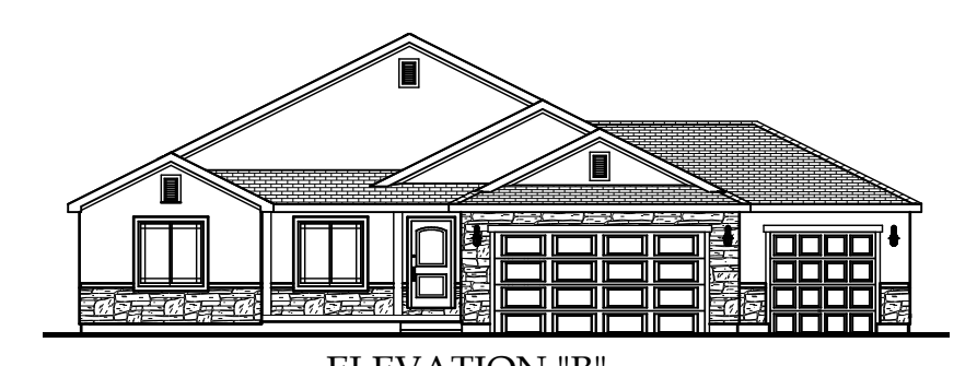
ELEVATION "B" SHOWN w/OPTIONAL STONE