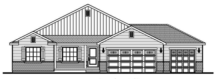
ELEVATION "C" SHOWN w/OPTIONAL WINDOWS IN GARAGE DOOR