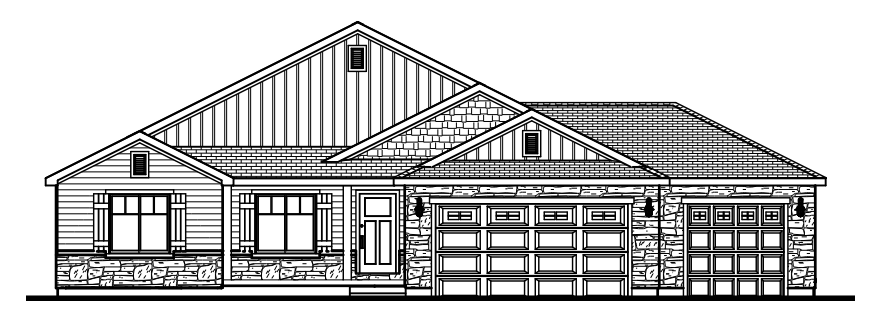
ELEVATION "D" SHOWN w/OPTIONAL WINDOWS IN GARAGE DOOR AND STONE